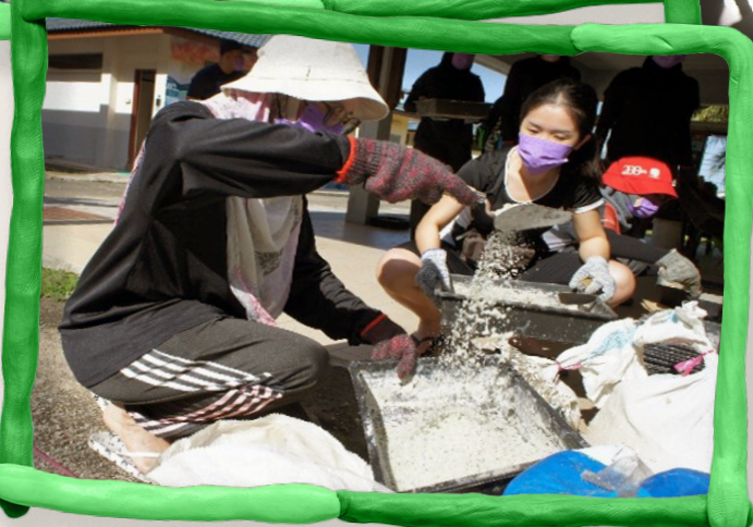
Volunteers actively participated in processing glass bottles to be repurposed into coral blocks that act as rehabilitation sites for damaged coral reefs.