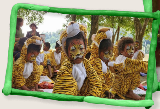
RIMAU engages with Orang Asli children in RBSP to create awareness of wildlife conservation about the Malayan Tiger.