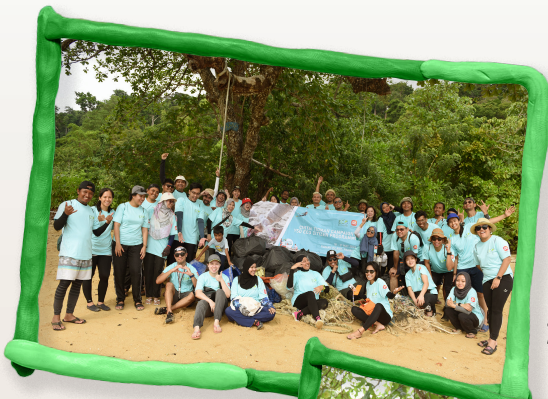
Together with the volunteers, YSD collected 440 kilograms of trash from the secluded beach of Monkey Bay.