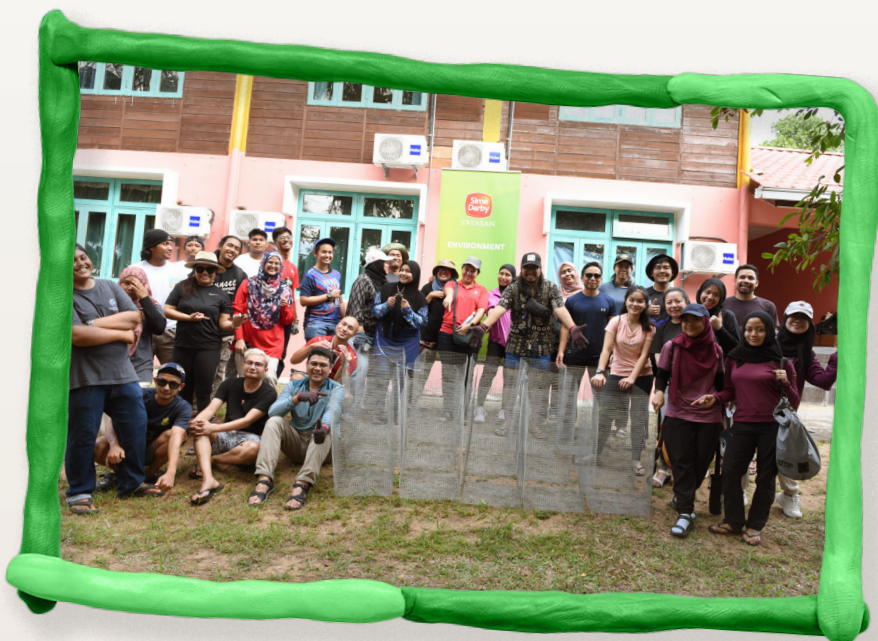
Proud YSD Eco Citizens showcasing the recycling bins.