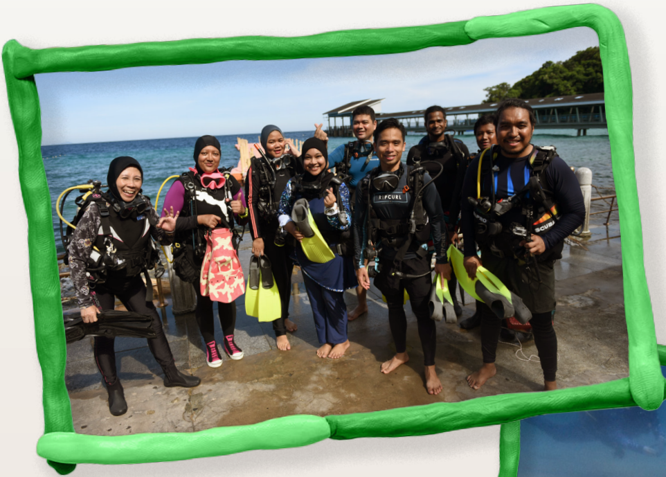
Dedicated volunteers dove into action, replanting corals and reviving existing coral blocks at the Tioman Marine Park.