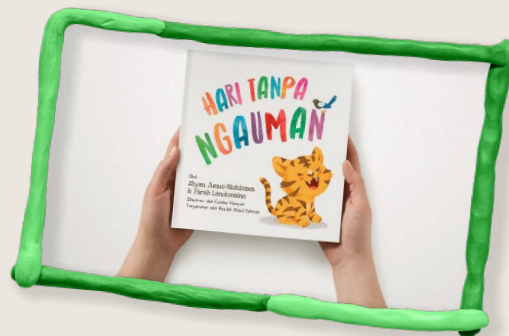
Hari Tanpa Ngauman book features Teega, a little Malayan Tiger who rules the jungle.