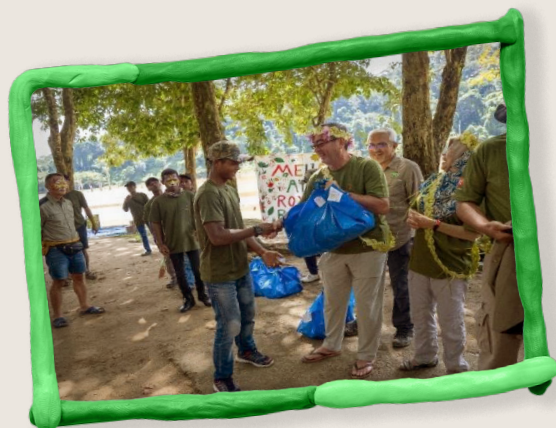
During the visit, YSD provided food aid and hygiene kits to 105 Orang Asli families in Kampung Sungai Kejar.