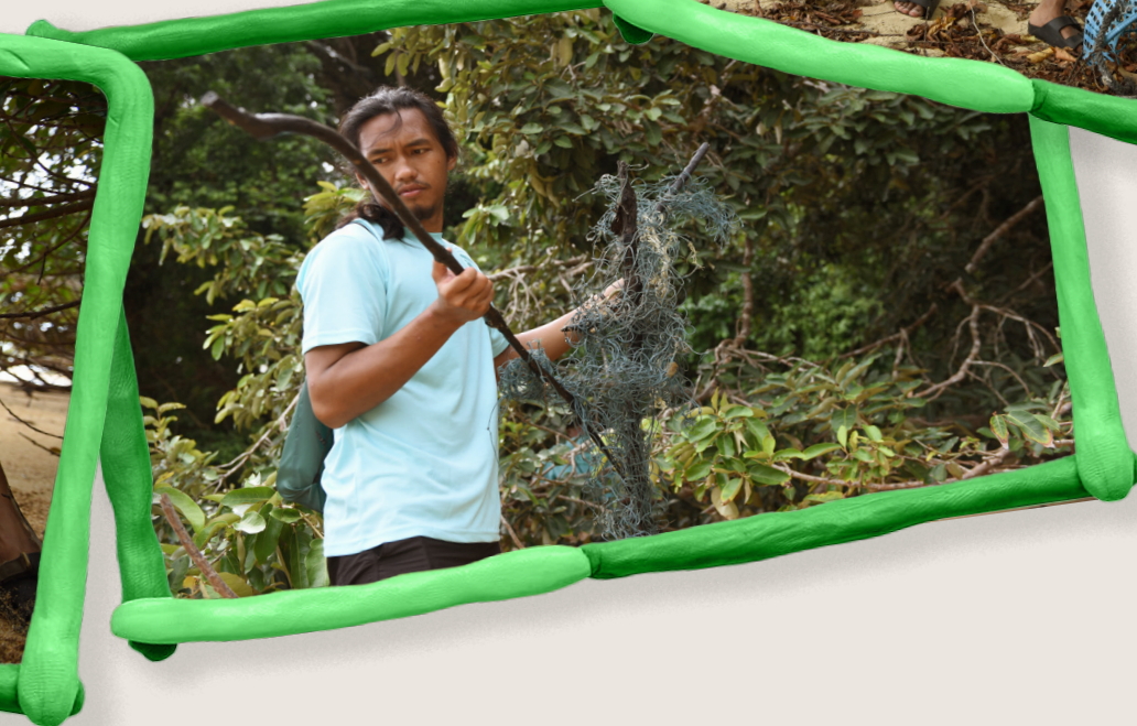
Scan the QR code below to embark on a virtual journey witnessing the beauty of Tioman and our collective efforts with project partners to preserve its natural wonders from excessive development: