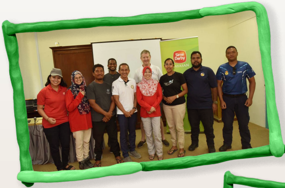
Stakeholders and partners from the Tioman Development Authority (TDA), Department of Fisheries (DoF), RCM, and JTP come together for the premiere of the YSD Cintai Tioman campaign video, united in their commitment to safeguard Pulau Tioman's natural heritage.