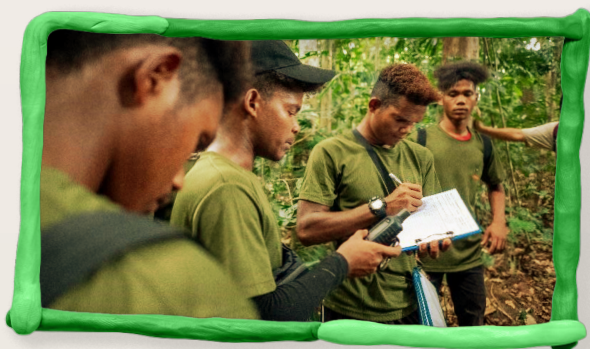
Orang Asli youth employed, trained, and equipped as Menraq patrollers.