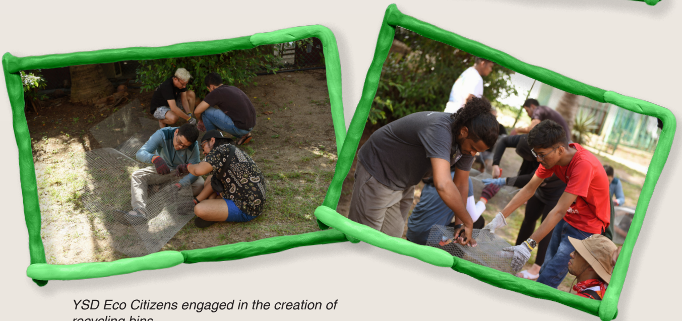
YSD Eco Citizens engaged in the creation of recycling bins.