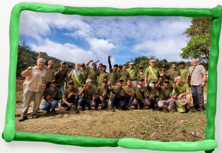
Menraq community-based wildlife protection patrol team made up of Jahai youth.